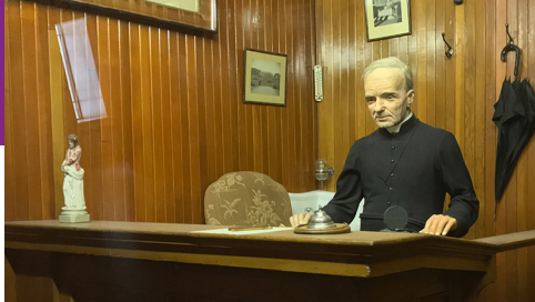
ABOVE: Wax figure of Brother André standing behind his desk in his actual office in the Oratory.