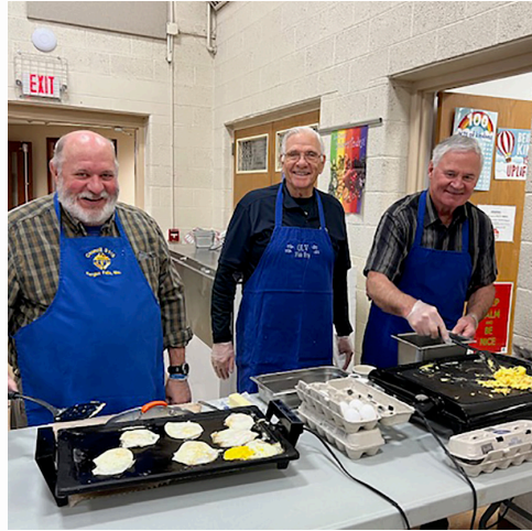
"How would you like your eggs?"

A delicious pancake breakfast was served to about 150 people on January 29. Eggs made to order, sausages, and fluffy pancakes were enjoyed by all! The Fellowship Hall rang with fellowship and laughter, and the scent of maple syrup and coffee wafted down the hall to draw people in. The proceeds from the breakfast were donated to the OLV Teachers' Fund to be spent on classroom materials. Thank you to all who attended and all who cooked and served this wonderful breakfast! A big thank you also to those who helped put the kitchen back in order for the school lunches on Monday!